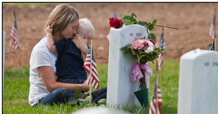
Memorial Day May 27, 2019